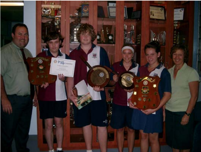
(Junior and Senior Young Chef Competition Winners—

The standard of competition is improving each year over the last six years and schools thank Rotary for this opportunity for students.